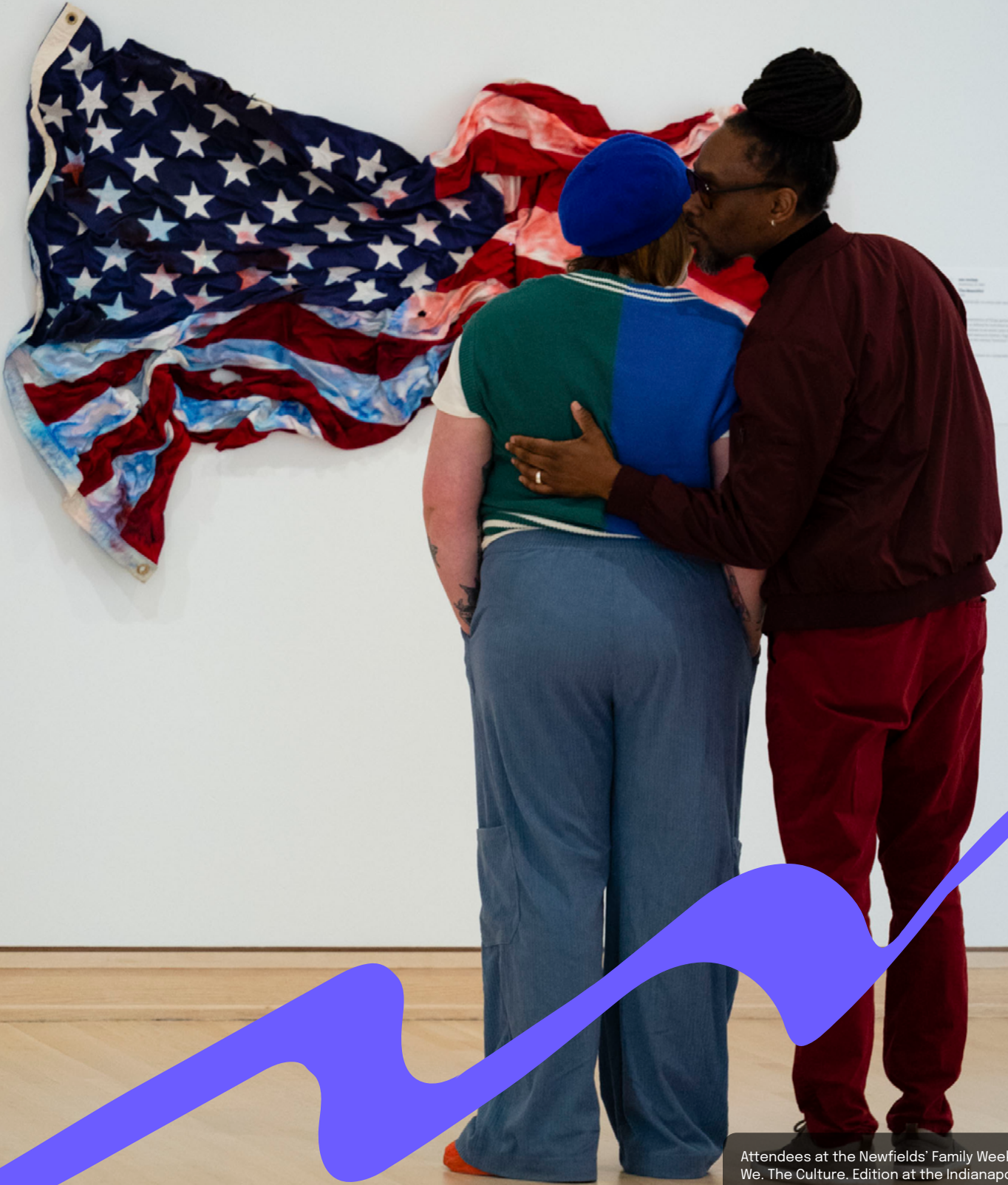
Attendees at the Newfields' Family Weekend: We. The Culture. Edition at the Indianapolis Museum of Art, supported by the GIG Fund.