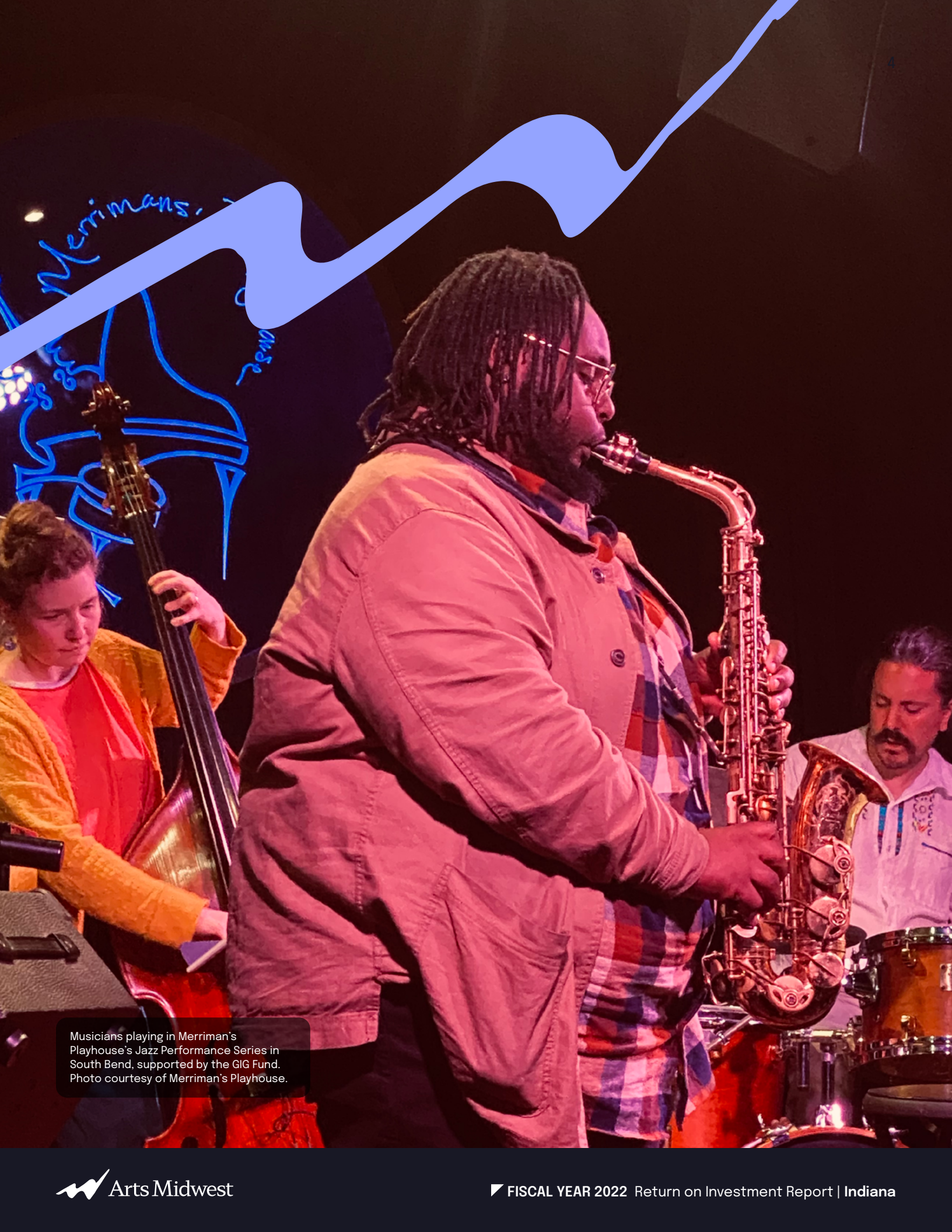
Musicians playing in Merriman's Playhouse's Jazz Performance Series in South Bend, supported by the GIG Fund.