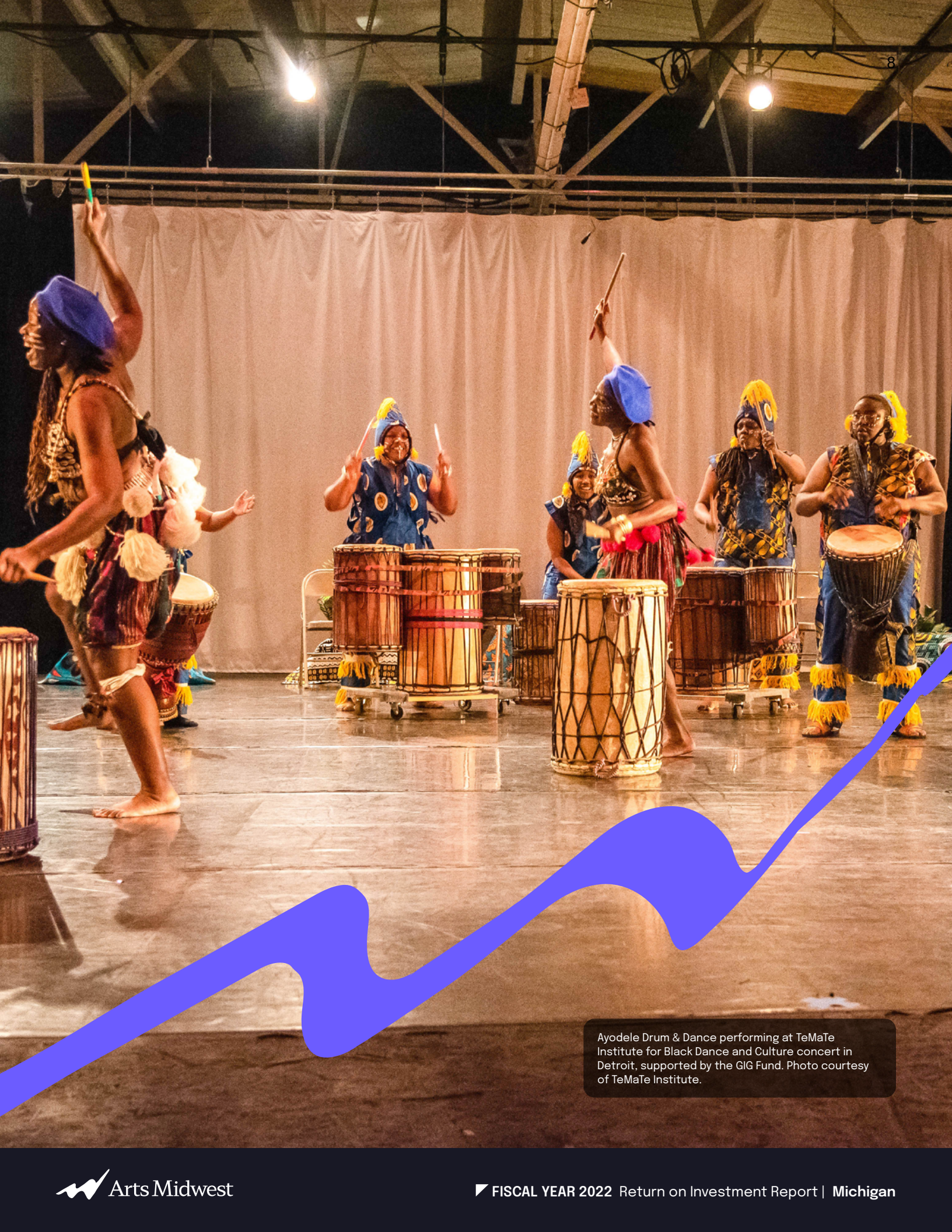
Ayodele Drum & Dance performing at TeMaTe Institute for Black Dance and Culture concert in Detroit, supported by the GIG Fund.