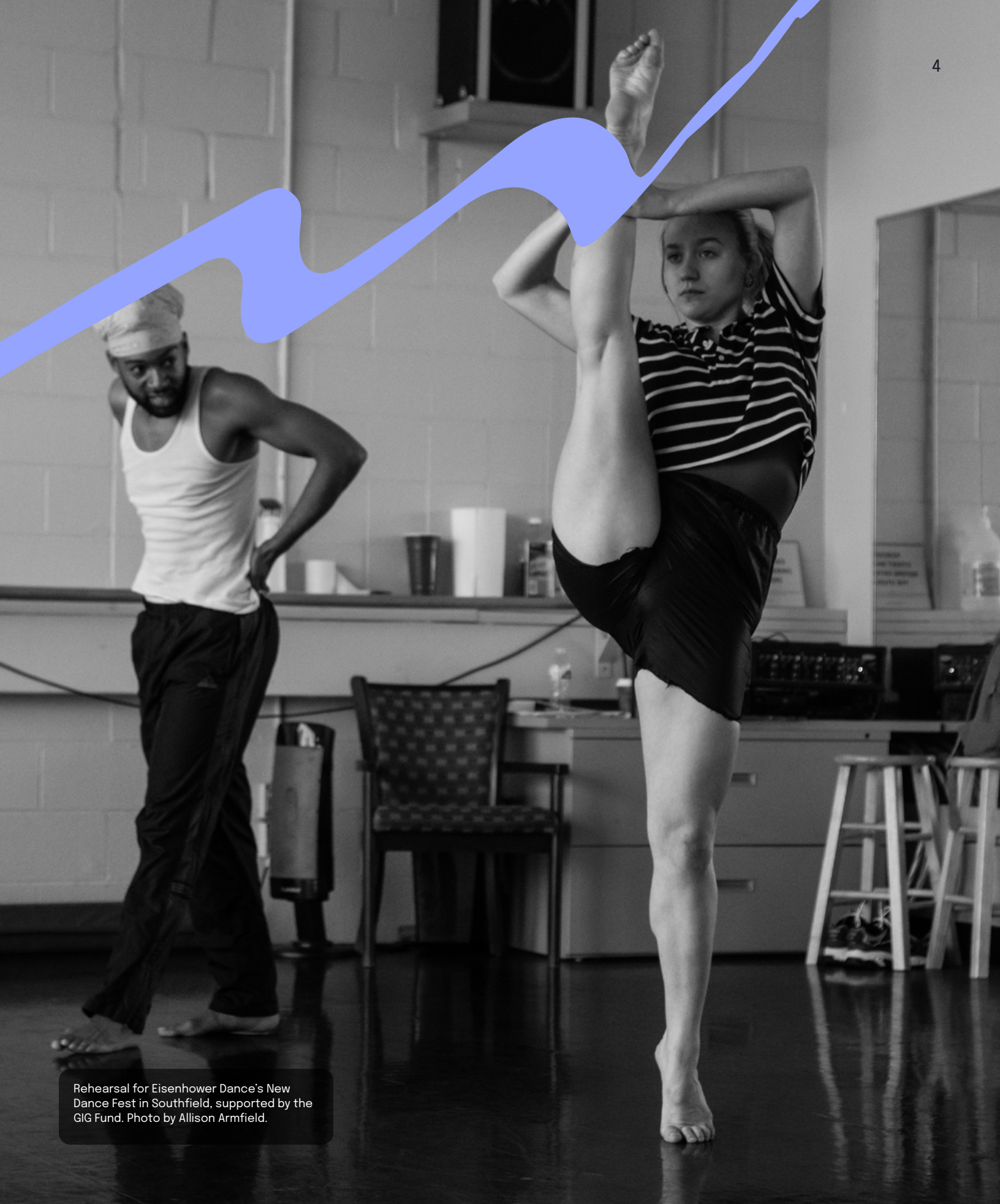
Rehearsal for Eisenhower Dance's New Dance Fest in Southfield, supported by the GIG Fund.