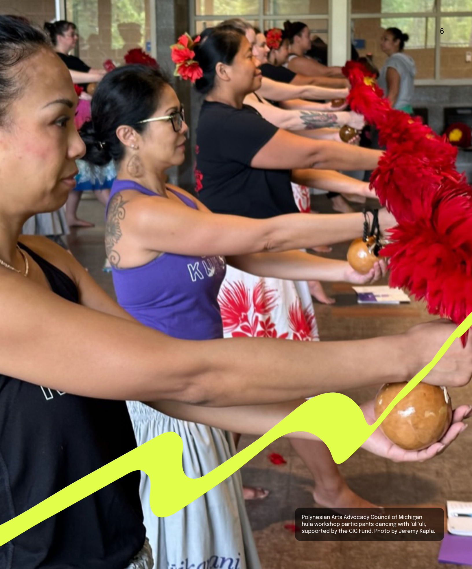
Polynesian Arts Advocacy Council of Michigan hula workshop participants dancing with 'uli'uli, supported by the GIG Fund.