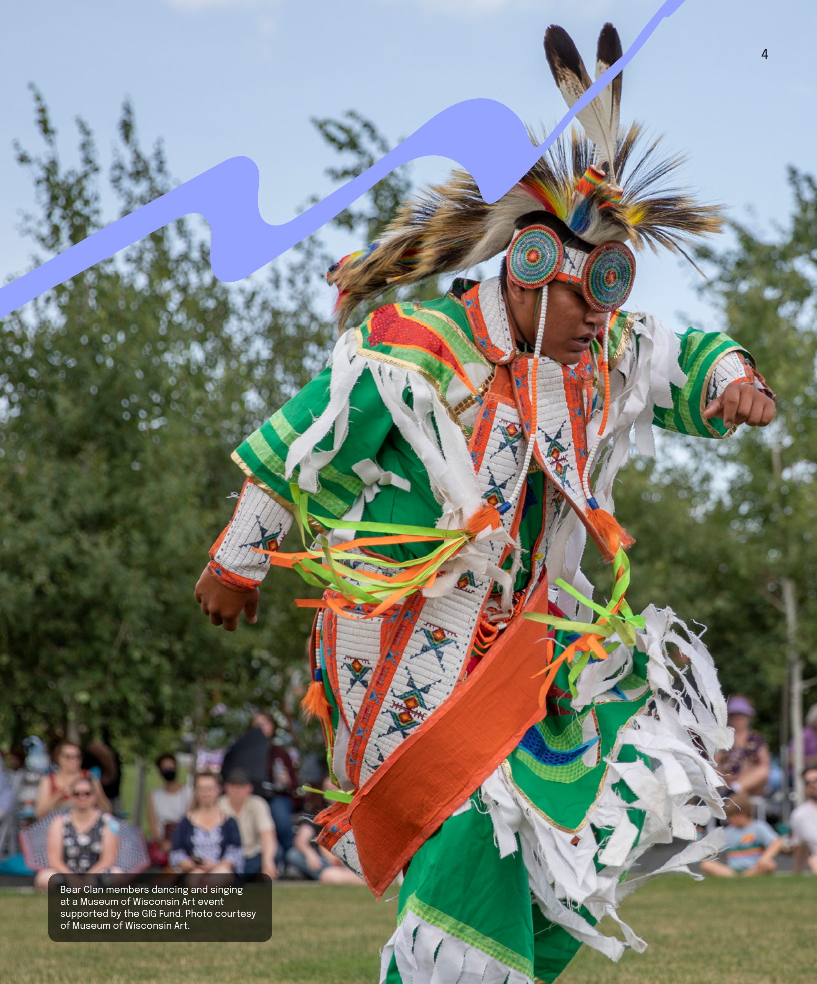
Bear Clan members dancing and singing at a Museum of Wisconsin Art event supported by the GIG Fund.