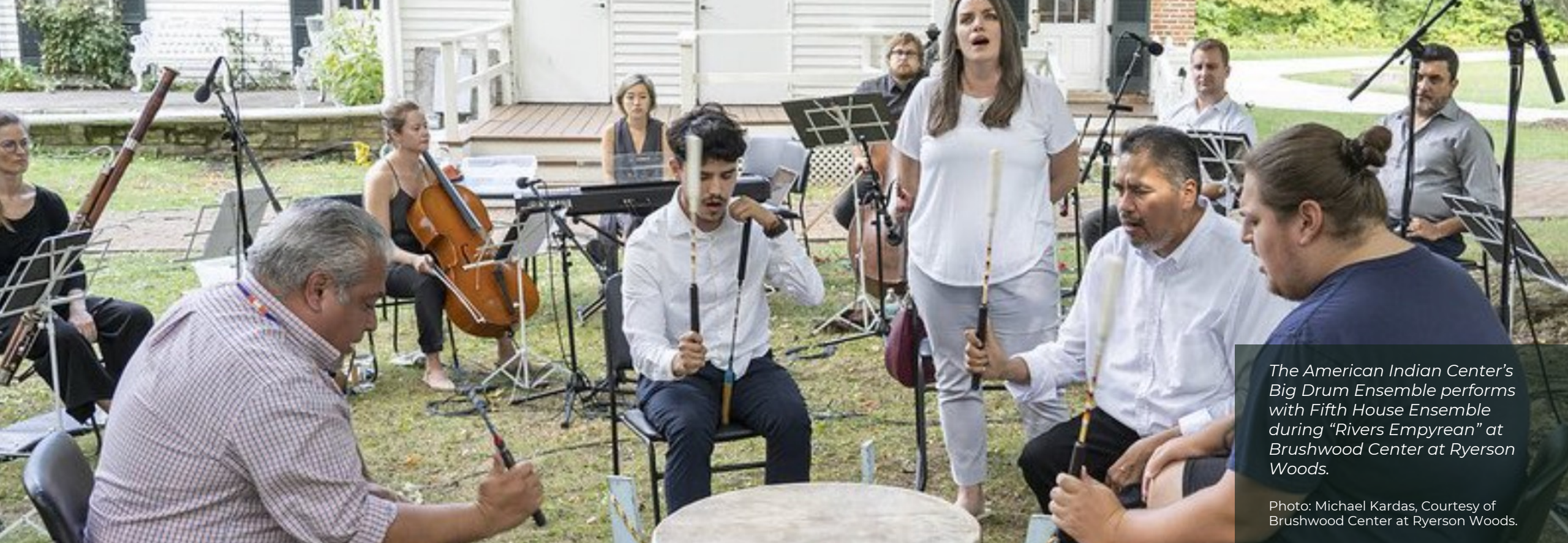
The American Indian Center's Big Drum Ensemble performs with Fifth House Ensemble during "Rivers Emphyrean" at Brushwood Center at Ryerson Woods.