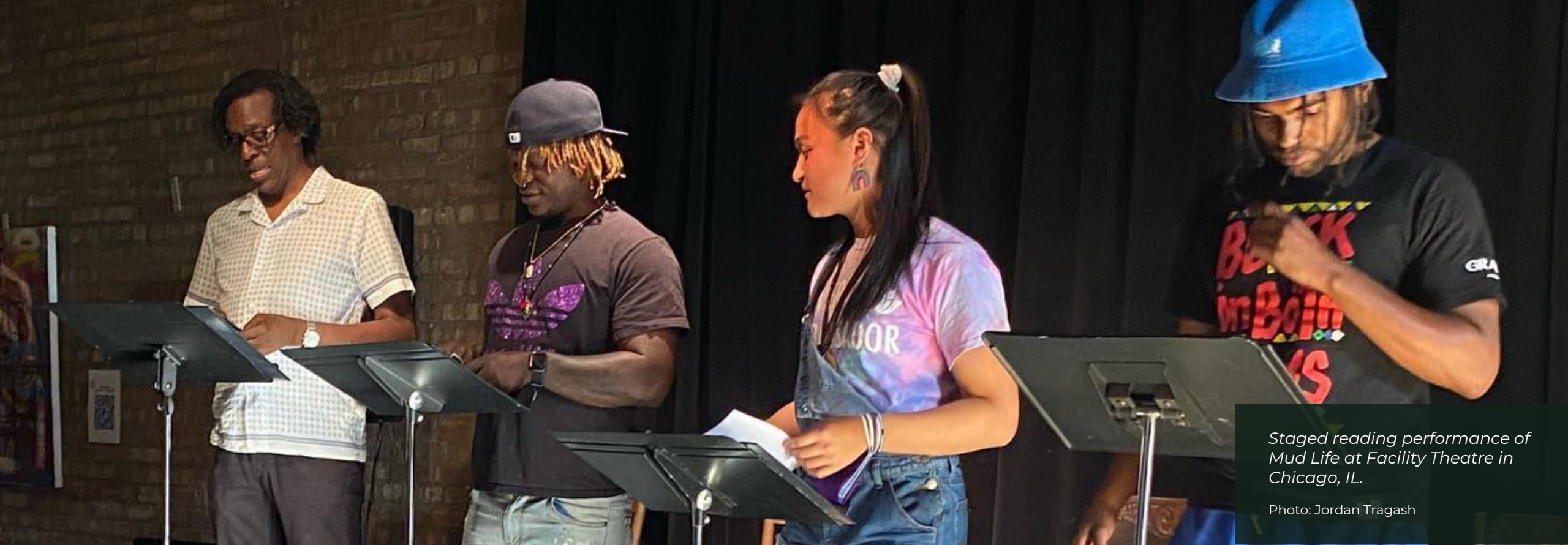
Staged reading performance of Mud Life at Facility Theatre in Chicago, IL.