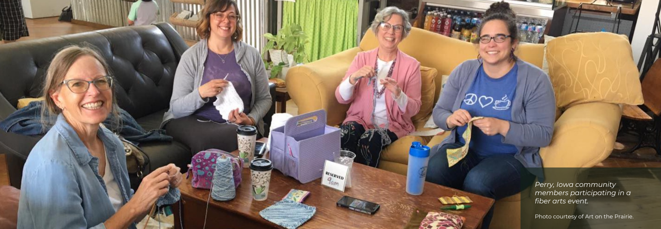
Perry, Iowa community members participating in a fiber arts event.