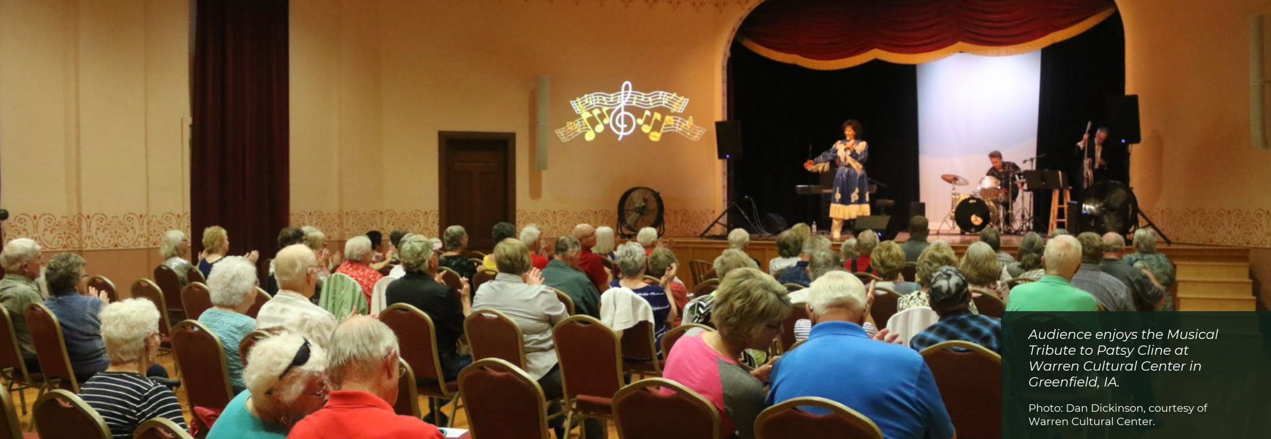
Audience enjoys the Musical Tribute to Patsy Cline at Warren Cultural Center in Greenfield, IA.