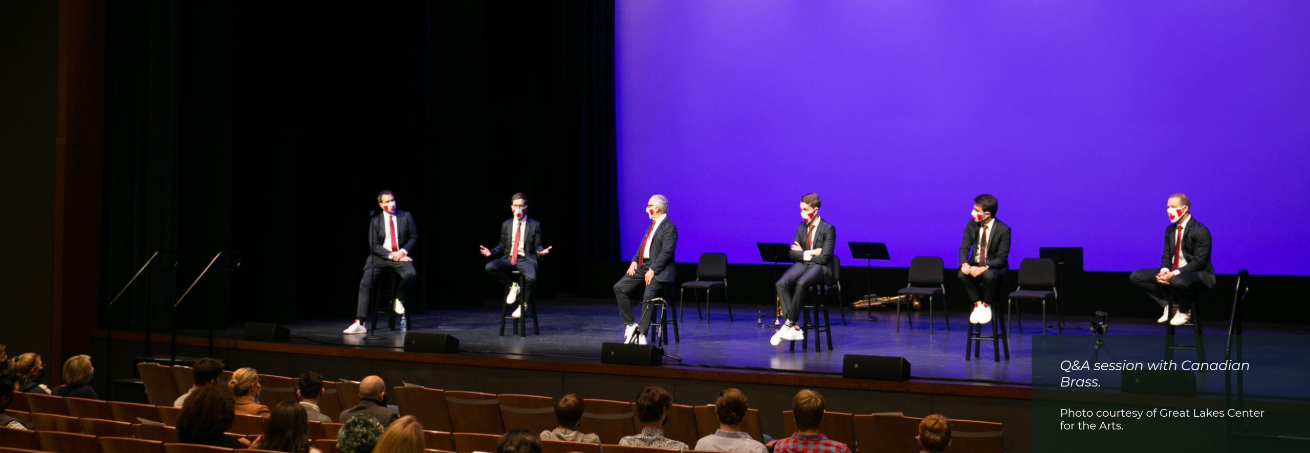
Q&A session with Canadian Brass.