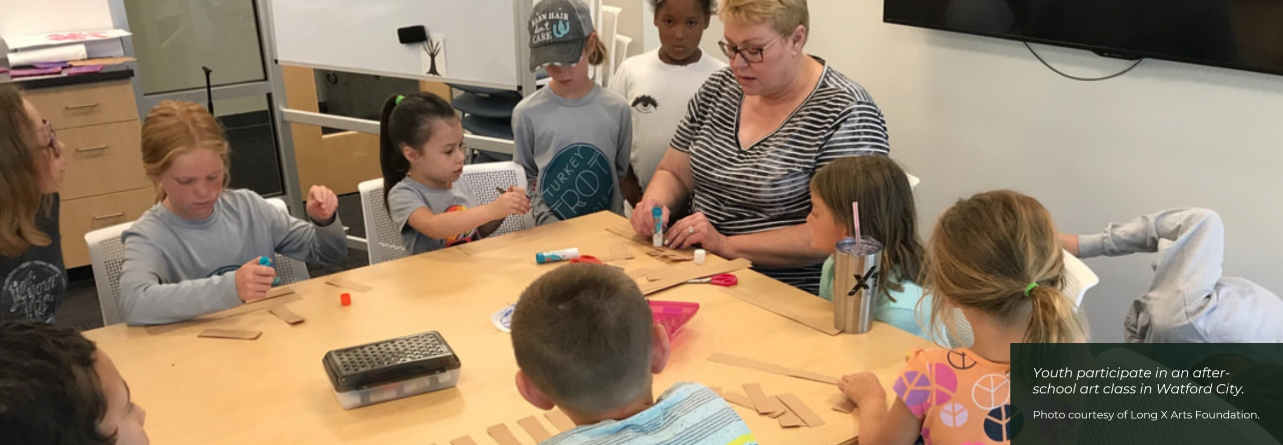
Youth participate in an after-school art class in Watford City.