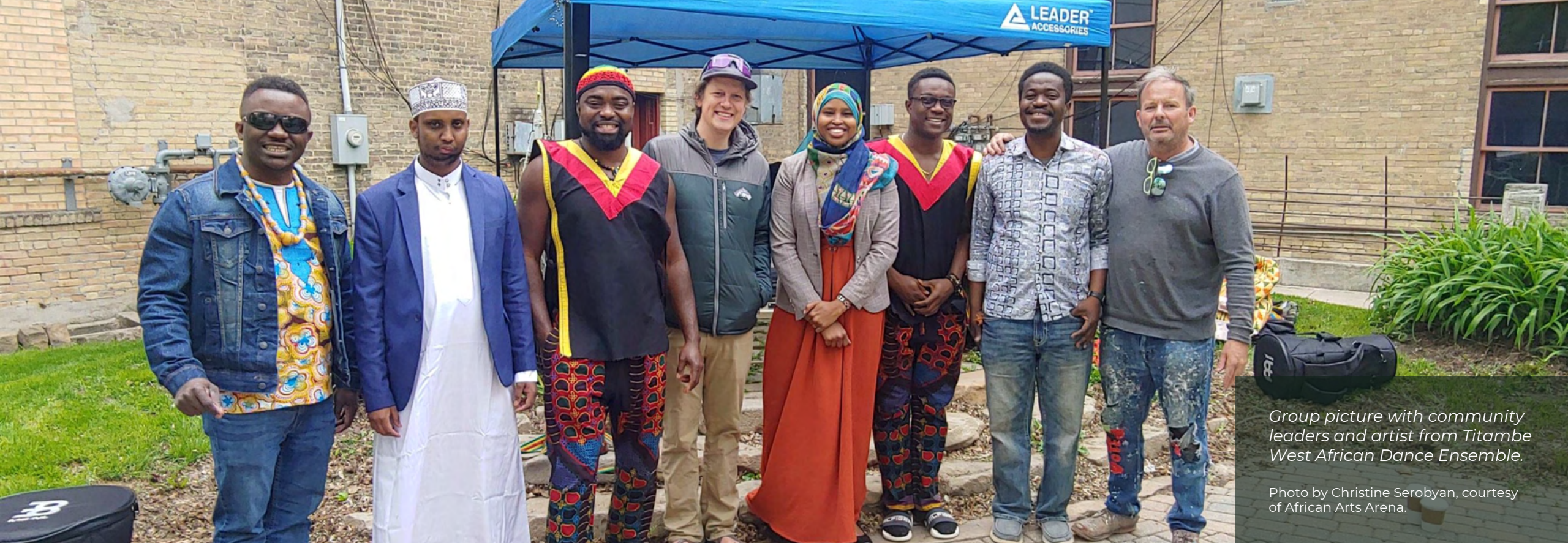
Group picture with community leaders and artist from Titambe West African Dance Ensemble.