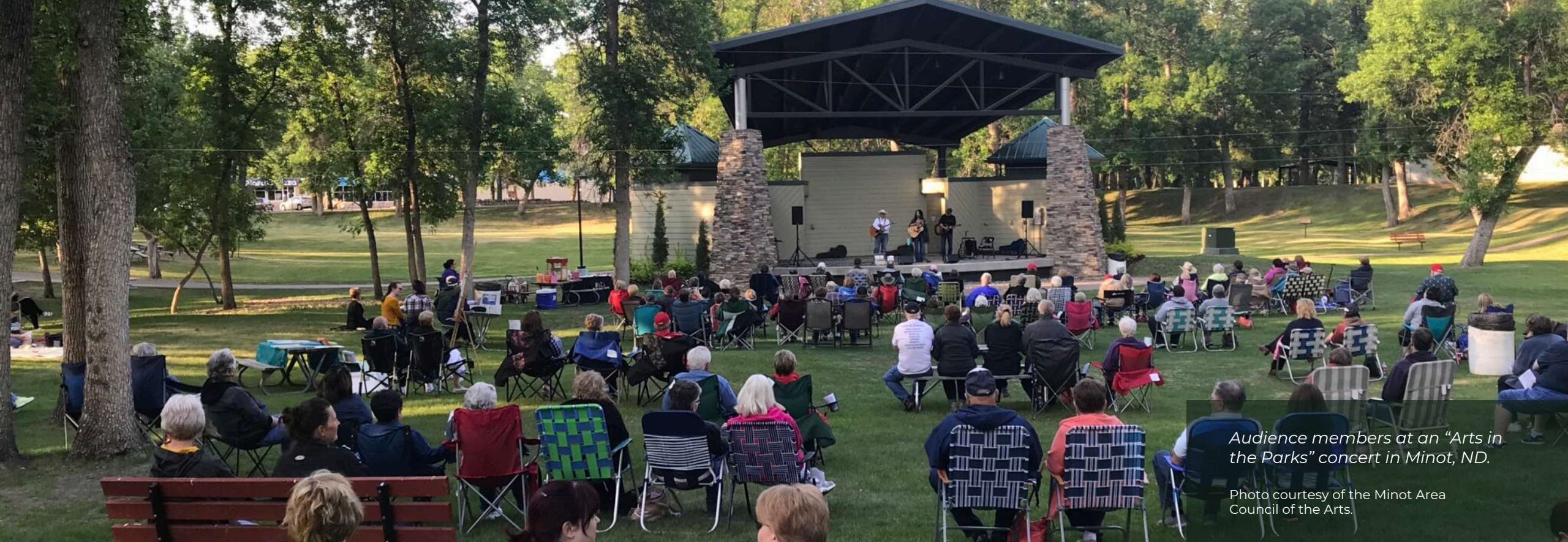
Audience members at an "Arts in the Parks" concert in Minot, ND.