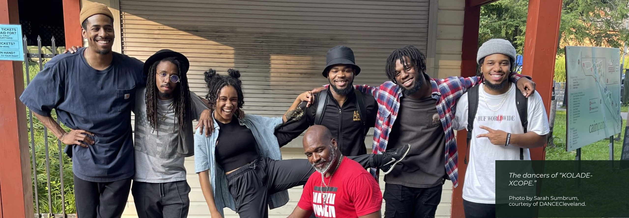
The dancers of "KOLADE-XCOPE."