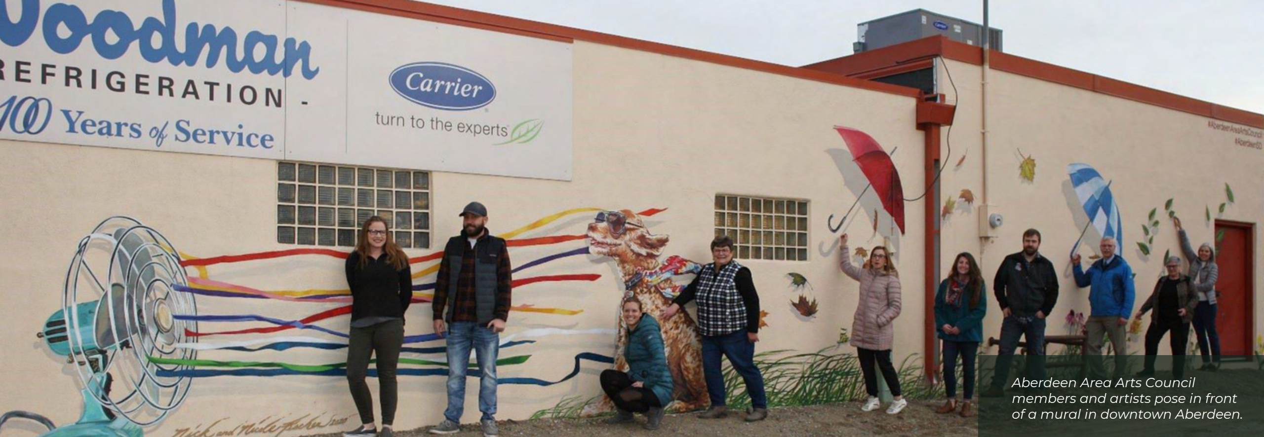
Aberdeen Area Arts Council members and artists pose in front of a mural in downtown Aberdeen.

We bring South Dakotans together to network, learn from each other, and find new ways to collaborate.