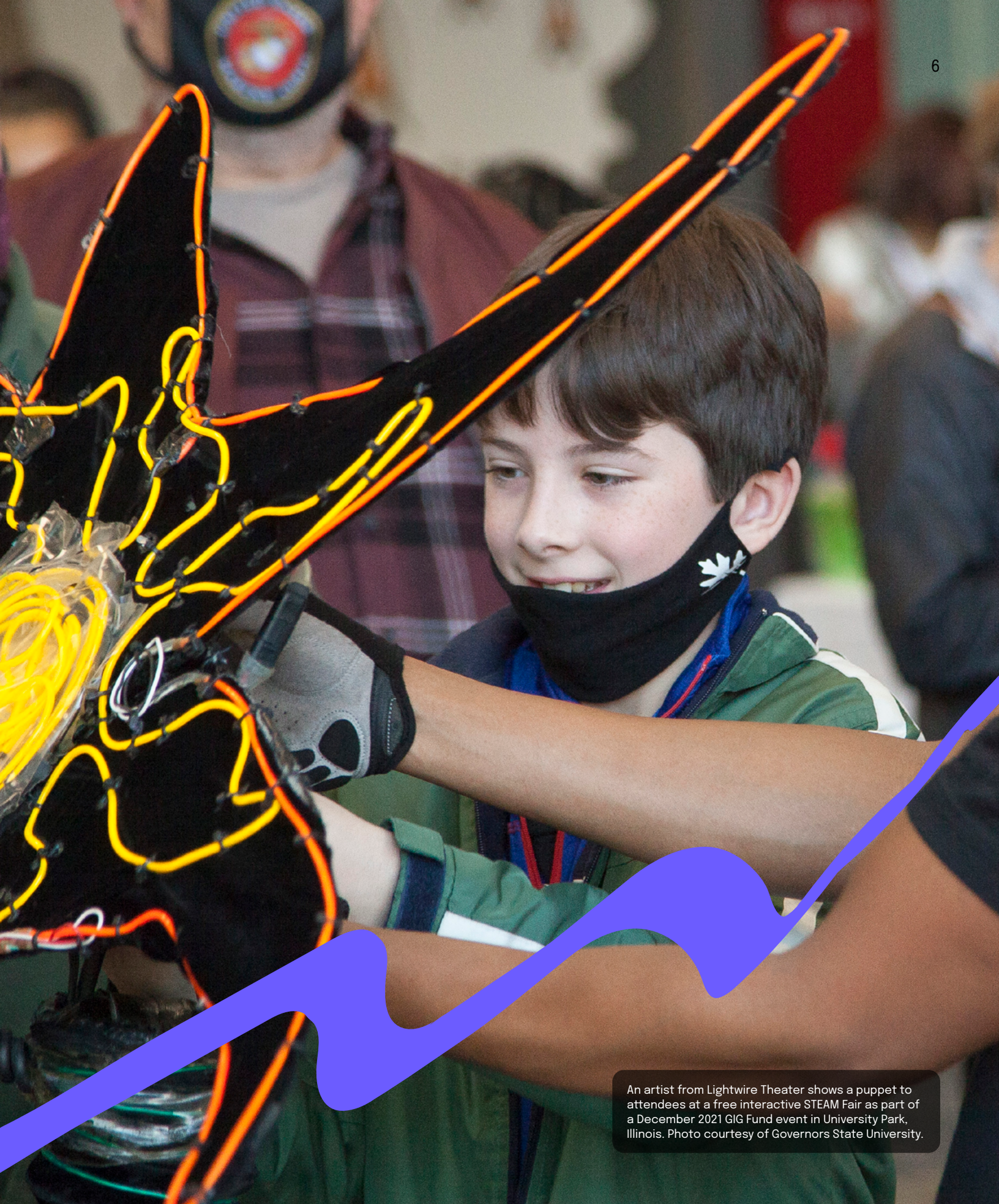
An artist from Lightwire Theater shows a puppet to attendees at a free interactive STEAM Fair as part of a December 2021 GIG Fund event in University Park, Illinois.