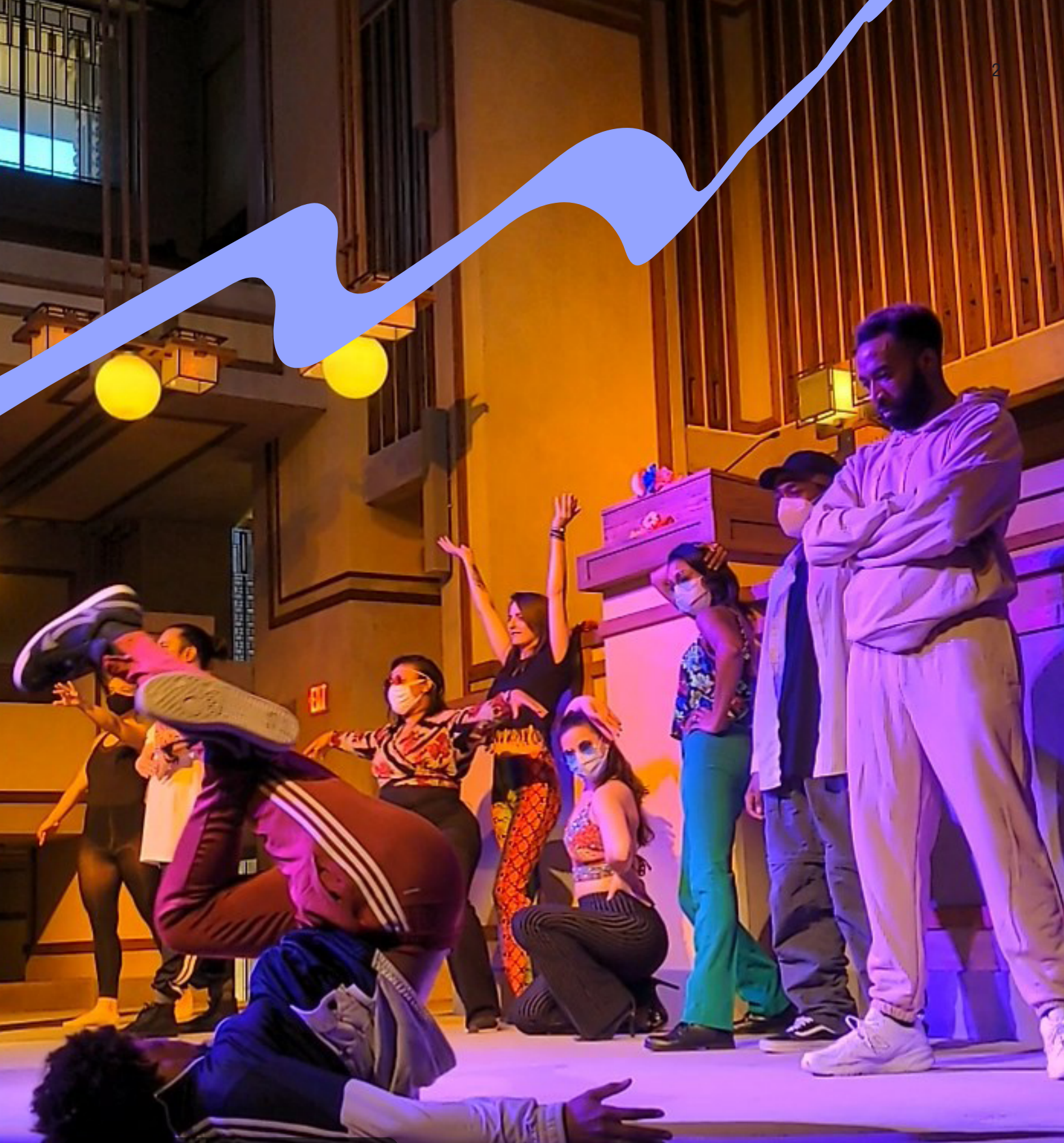
Movement Revolution Dance Crew performing at Oak Park's Unity Temple, supported by the GIG Fund.