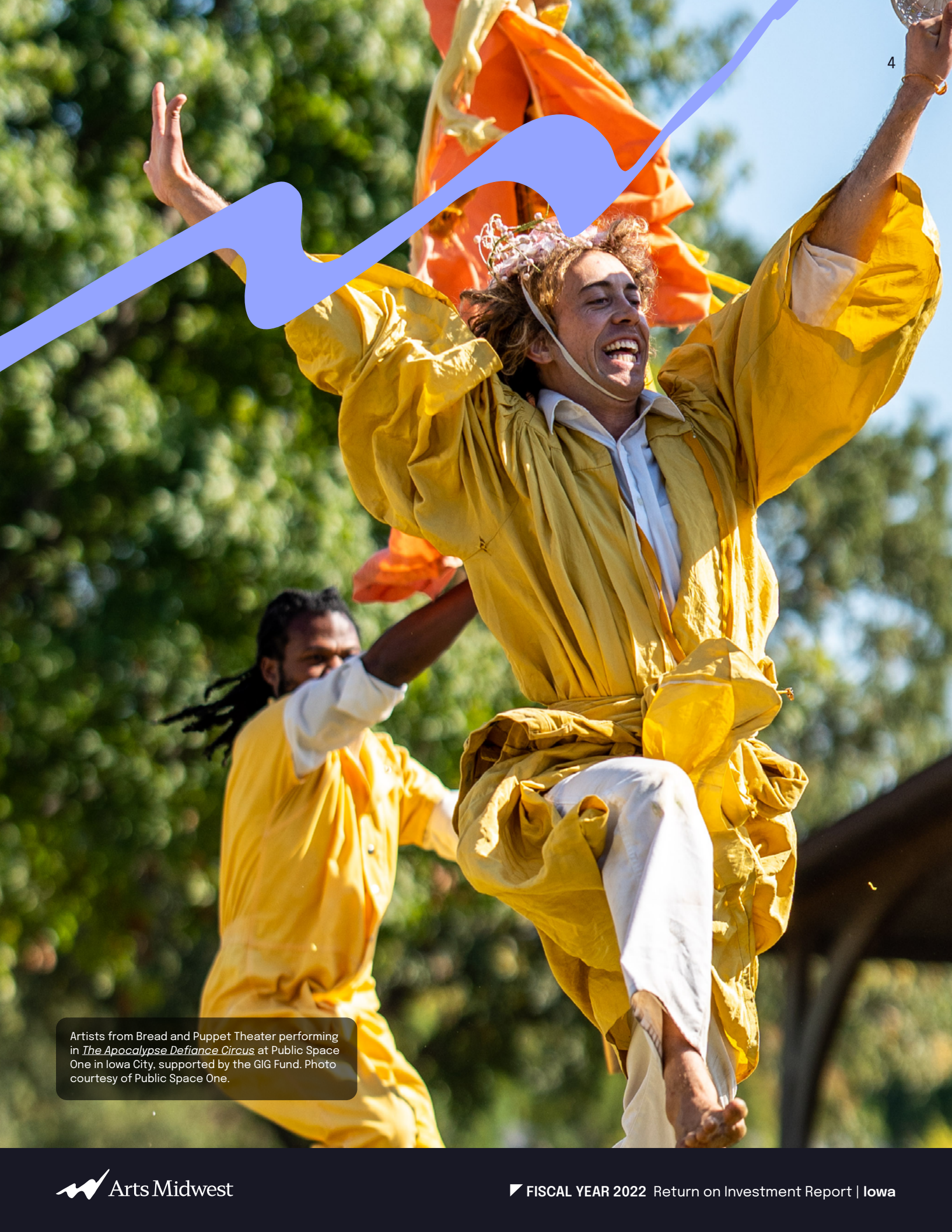
Artists from Bread and Puppet Theater performing in The Apocalypse Defiance Circus at Public Space One in Iowa City, supported by the GIG Fund.