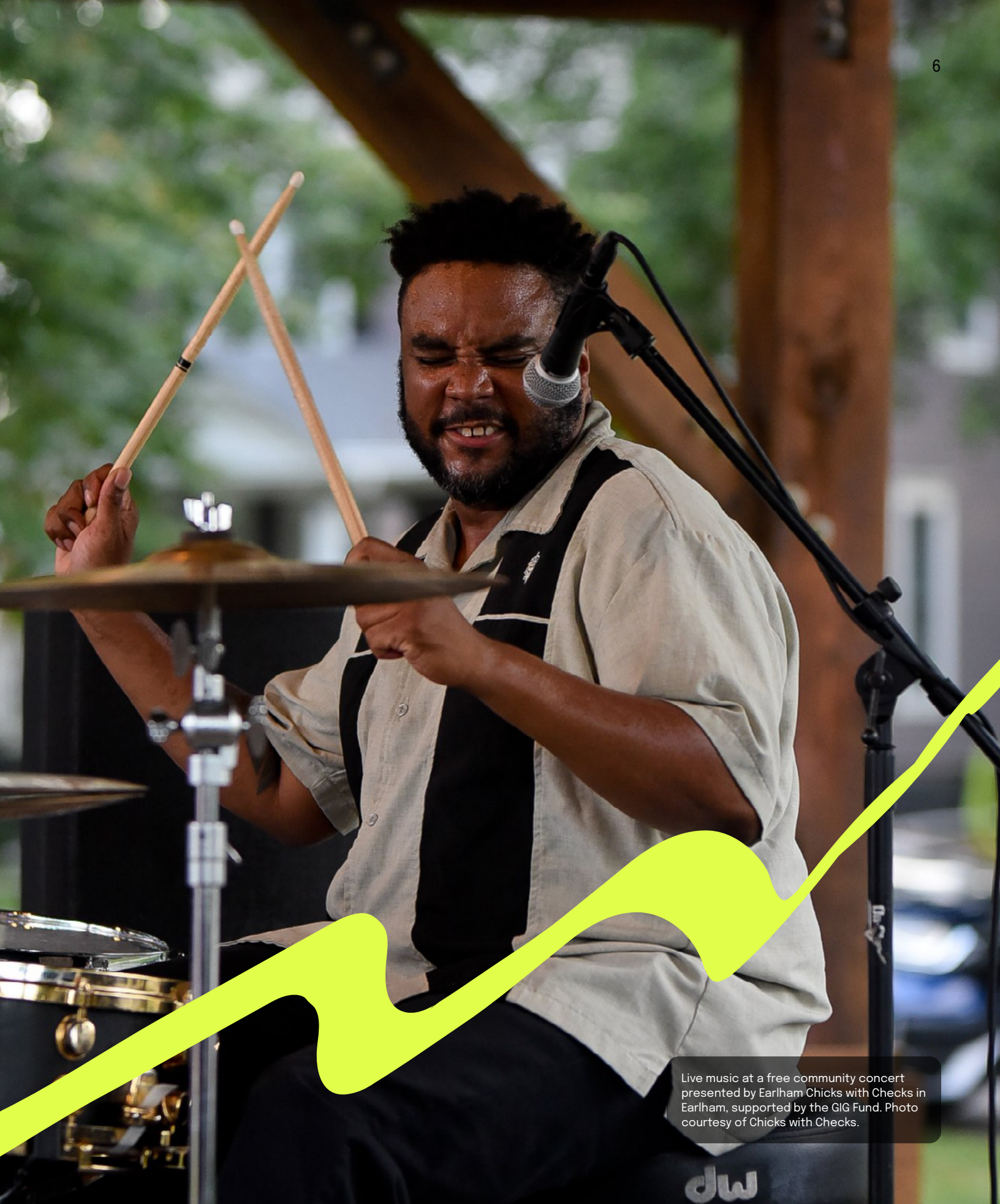
Live music at a free community concert presented by Earlham Chicks with Checks in Earlham, supported by the GIG Fund.