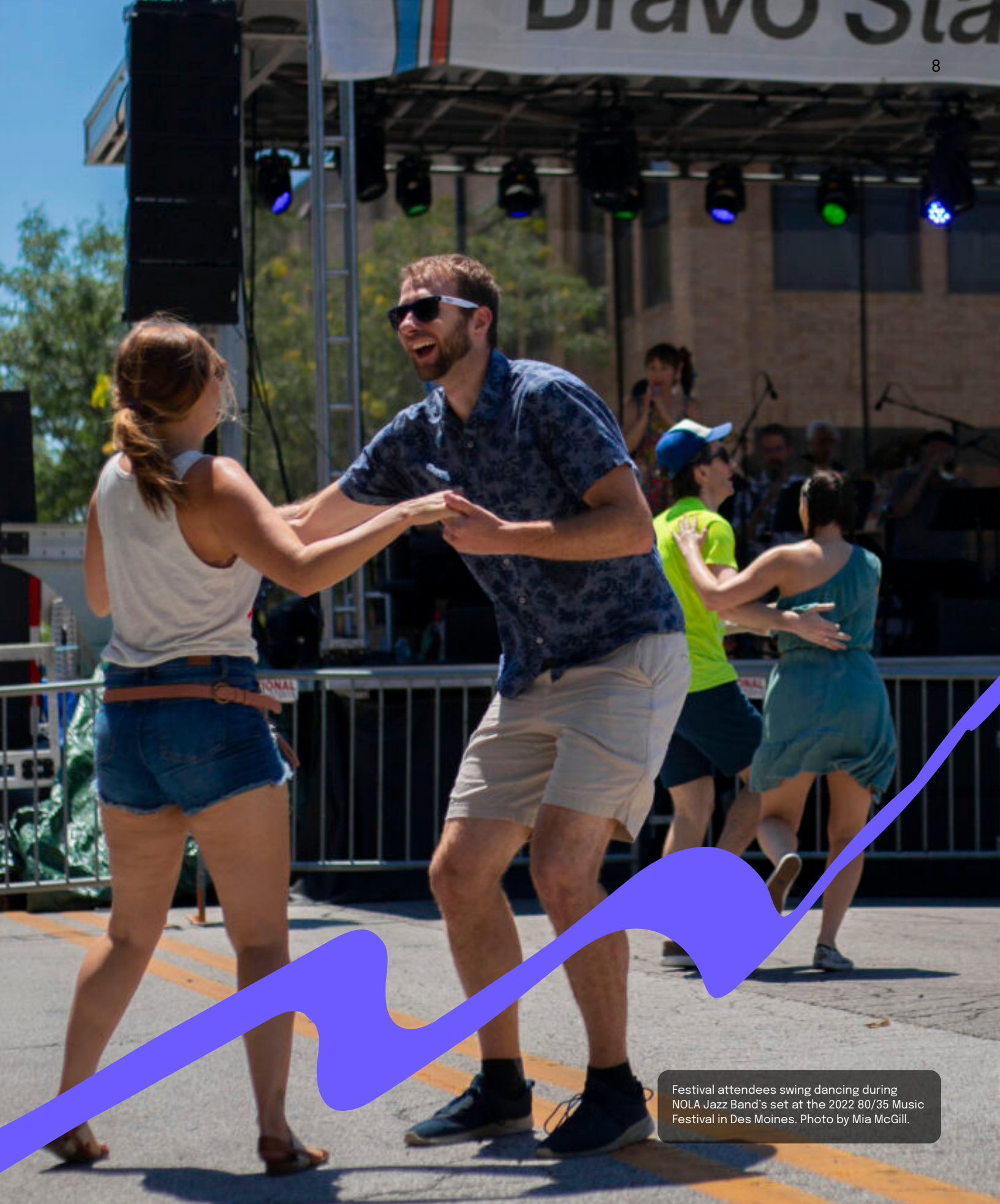
Festival attendees swing dancing during NOLA Jazz Band's set at the 2022 80/35 Music Festival in Des Moines.