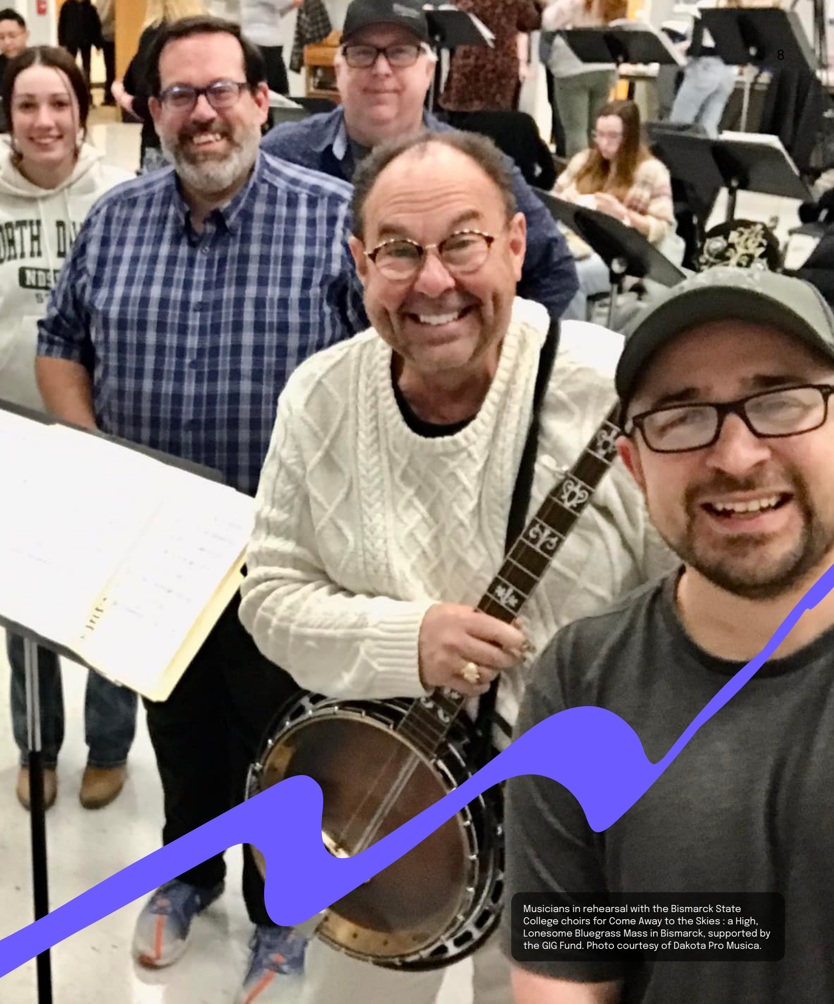
Musicians in rehearsal with the Bismarck State College choirs for Come Away to the Skies : a High, Lonesome Bluegrass Mass in Bismarck, supported by the GIG Fund.