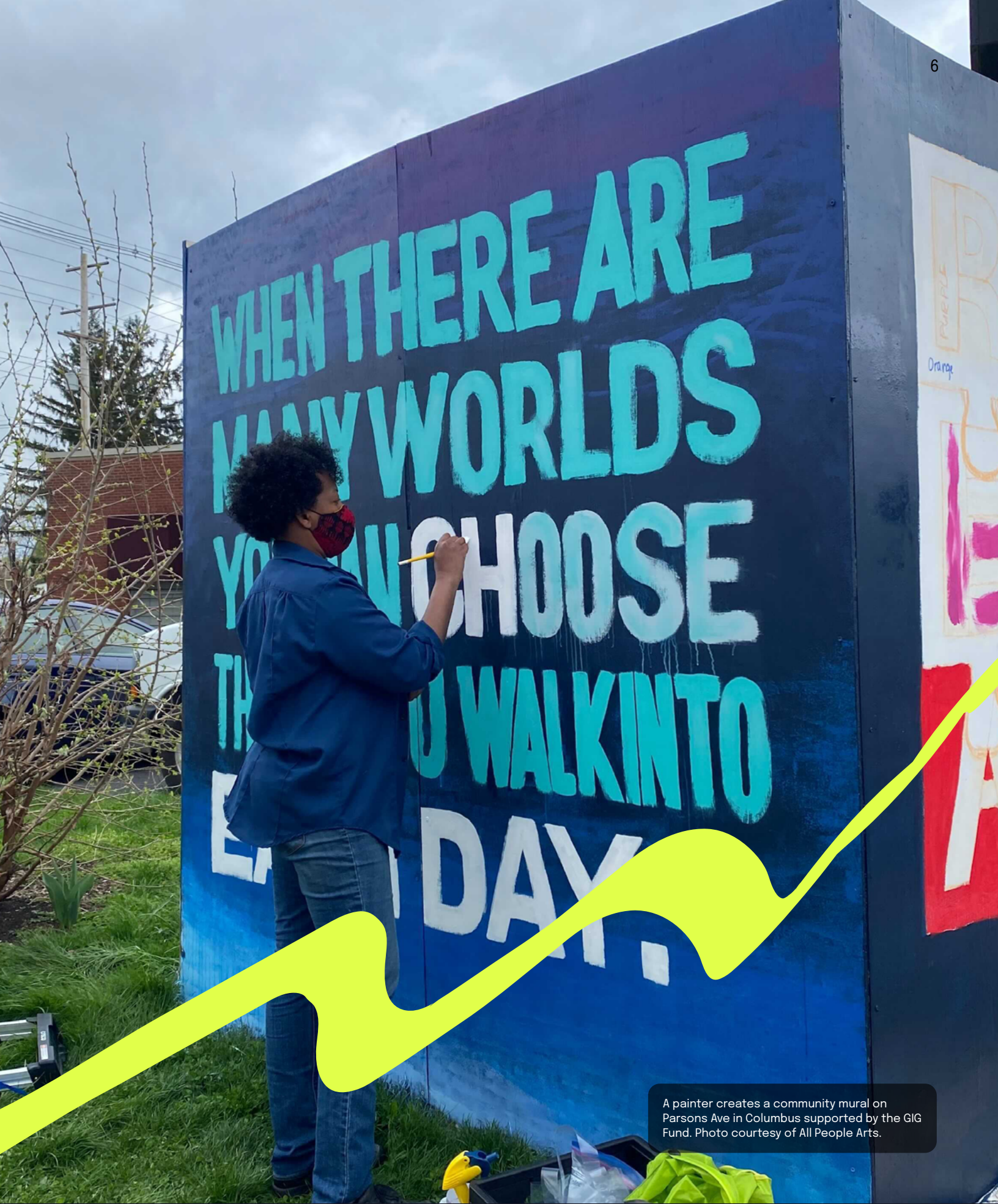
A painter creates a community mural on Parsons Ave in Columbus supported by the GIG Fund.