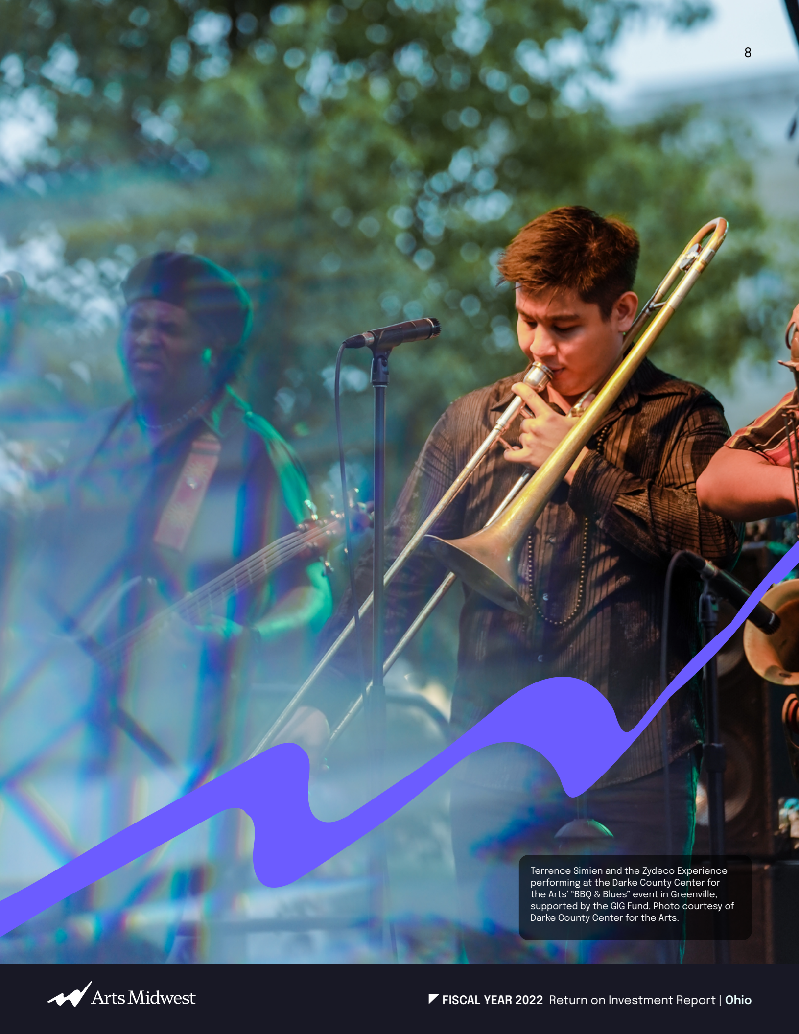
Terrence Simien and the Zydeco Experience performing at the Darke County Center for the Arts' "BBQ & Blues" event in Greenville, supported by the GIG Fund.