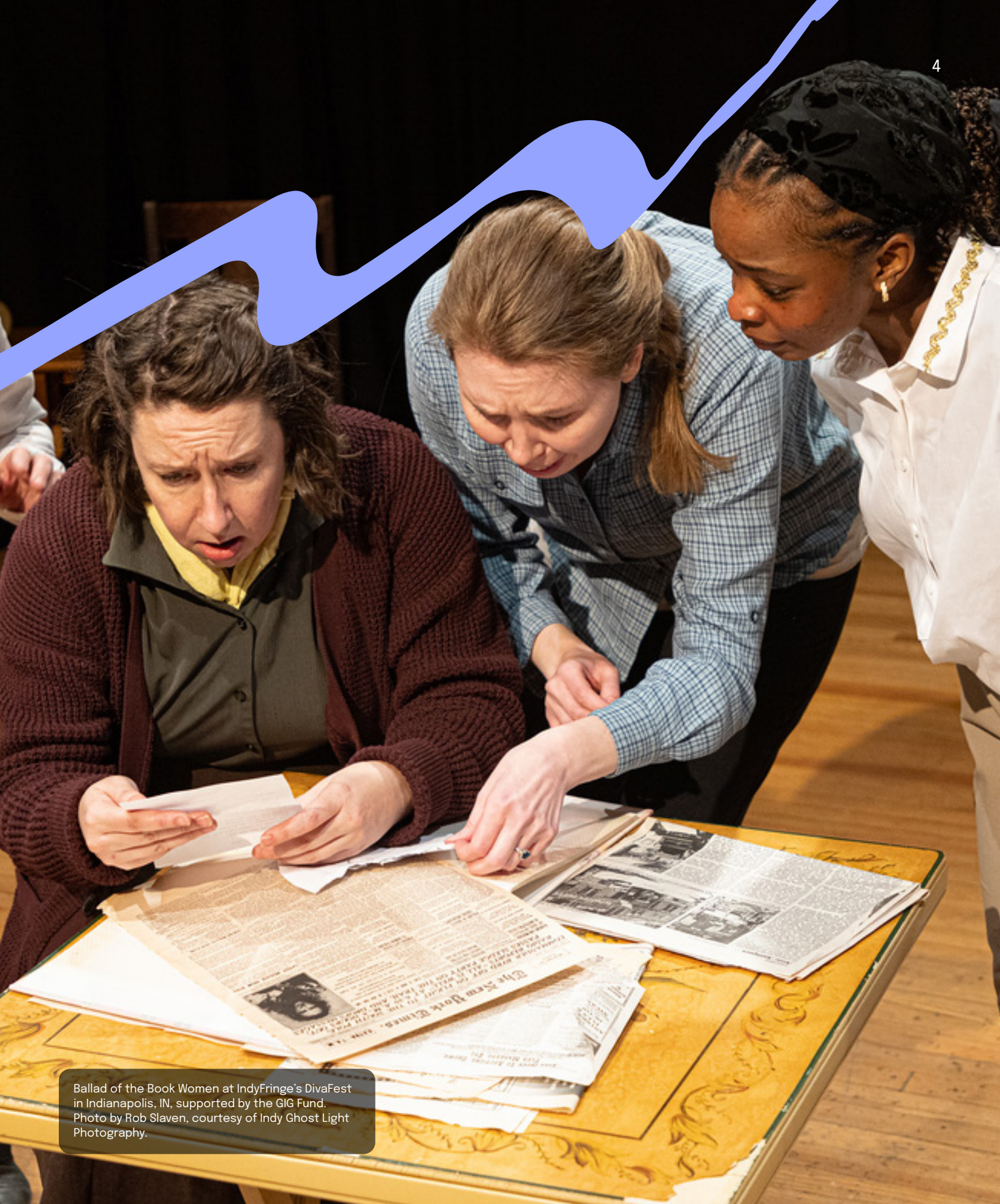
Ballad of the Book Women at IndyFringe's DivaFest in Indianapolis, IN, supported by the GIG Fund.