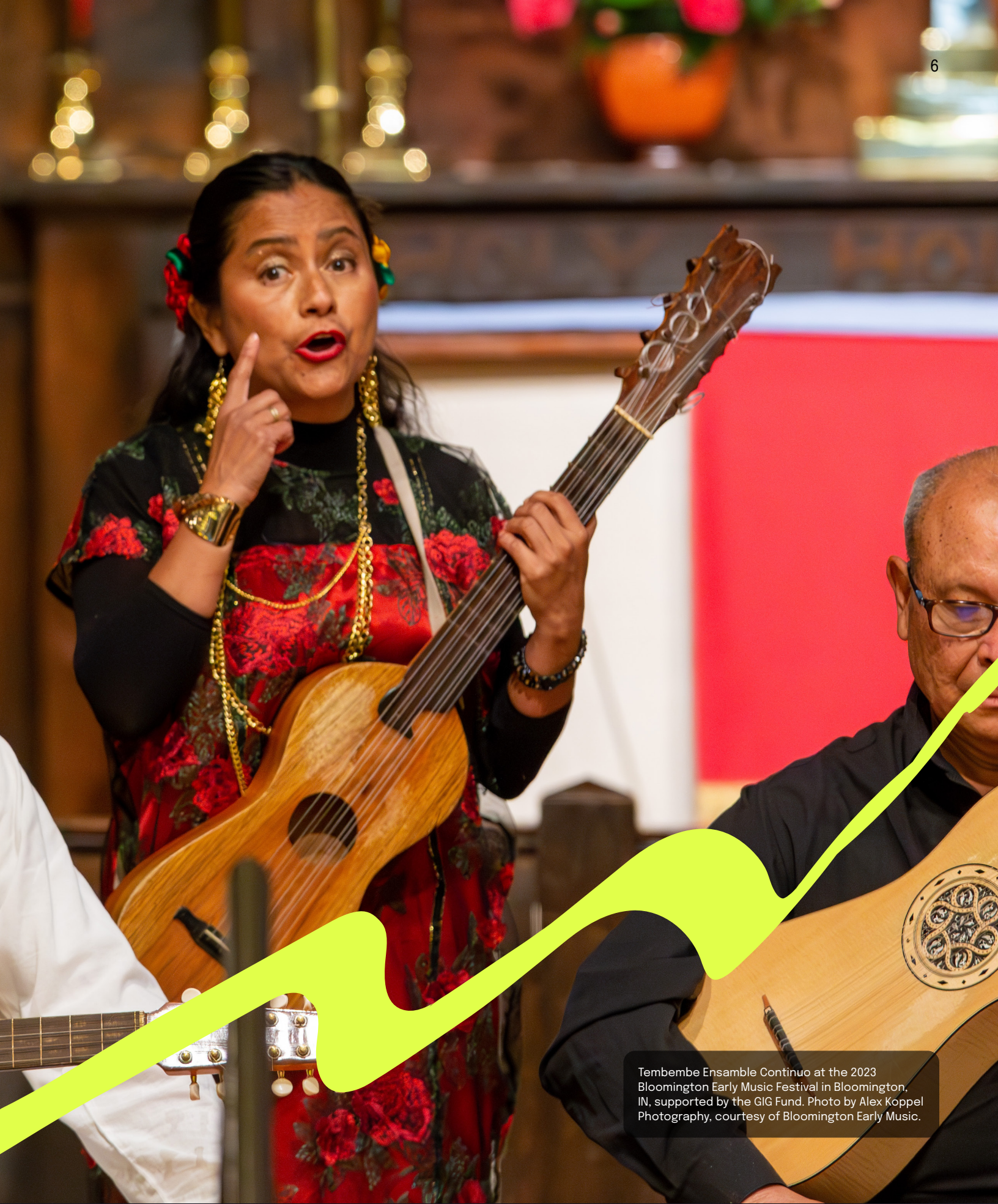
Tembembe Ensemble Continuo at the 2023 Bloomington Early Music Festival in Bloomington, IN, supported by the GIG Fund.