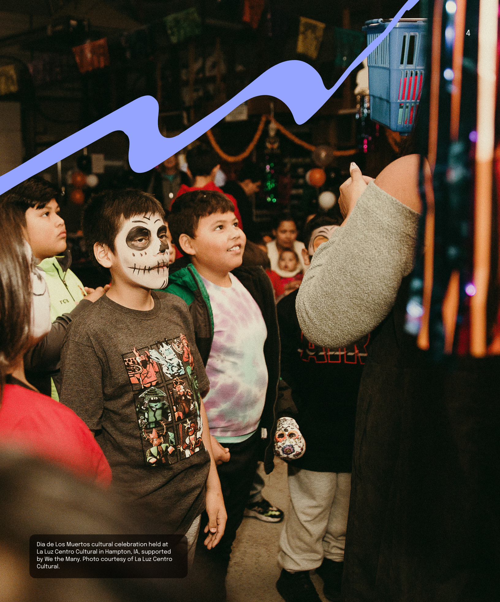
Dia de Los Muertos cultural celebration held at La Luz Centro Cultural in Hampton, IA, supported by We the Many.