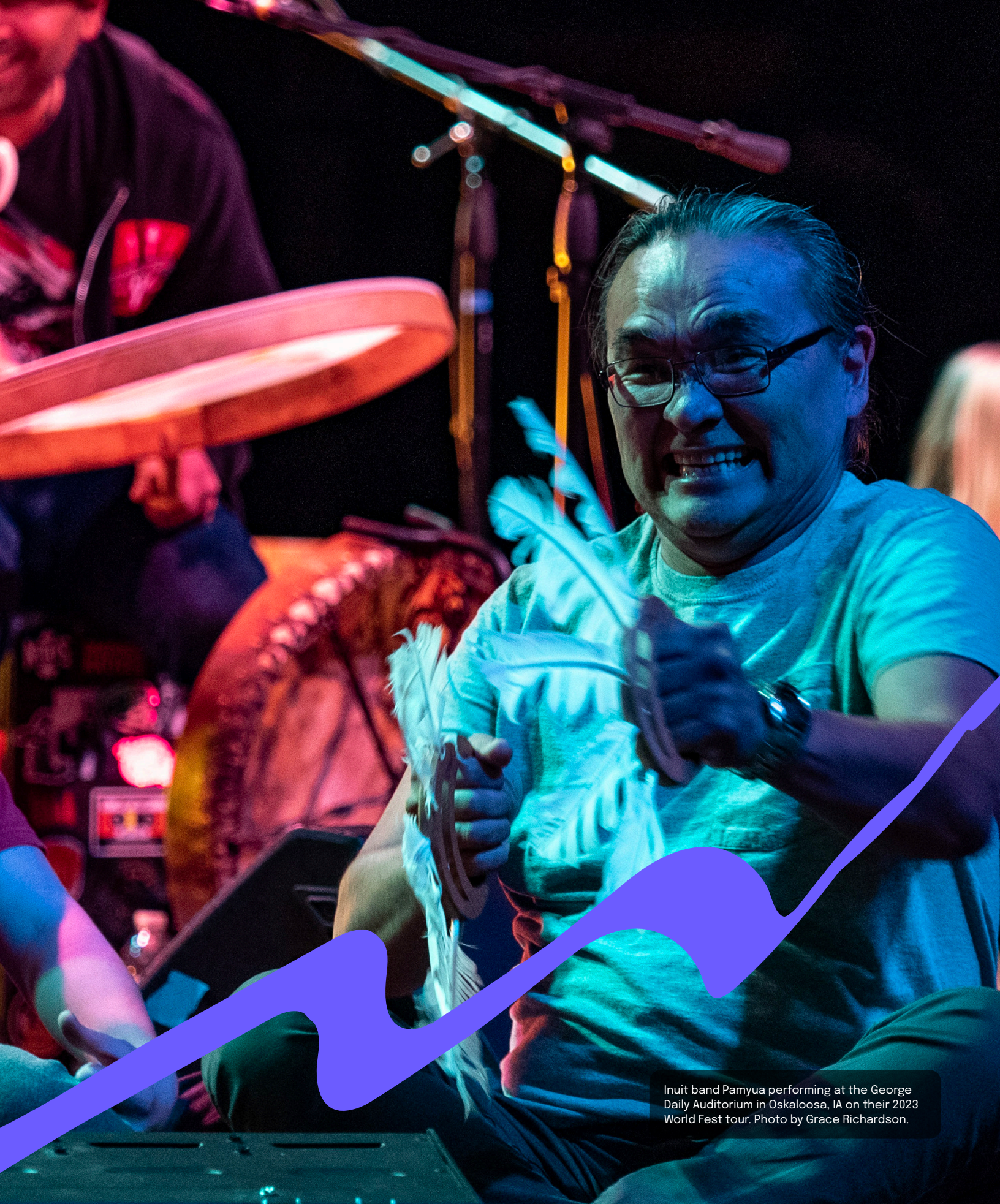
Inuit band Pamyua performing at the George Daily Auditorium in Oskaloosa, IA on their 2023 World Fest tour.