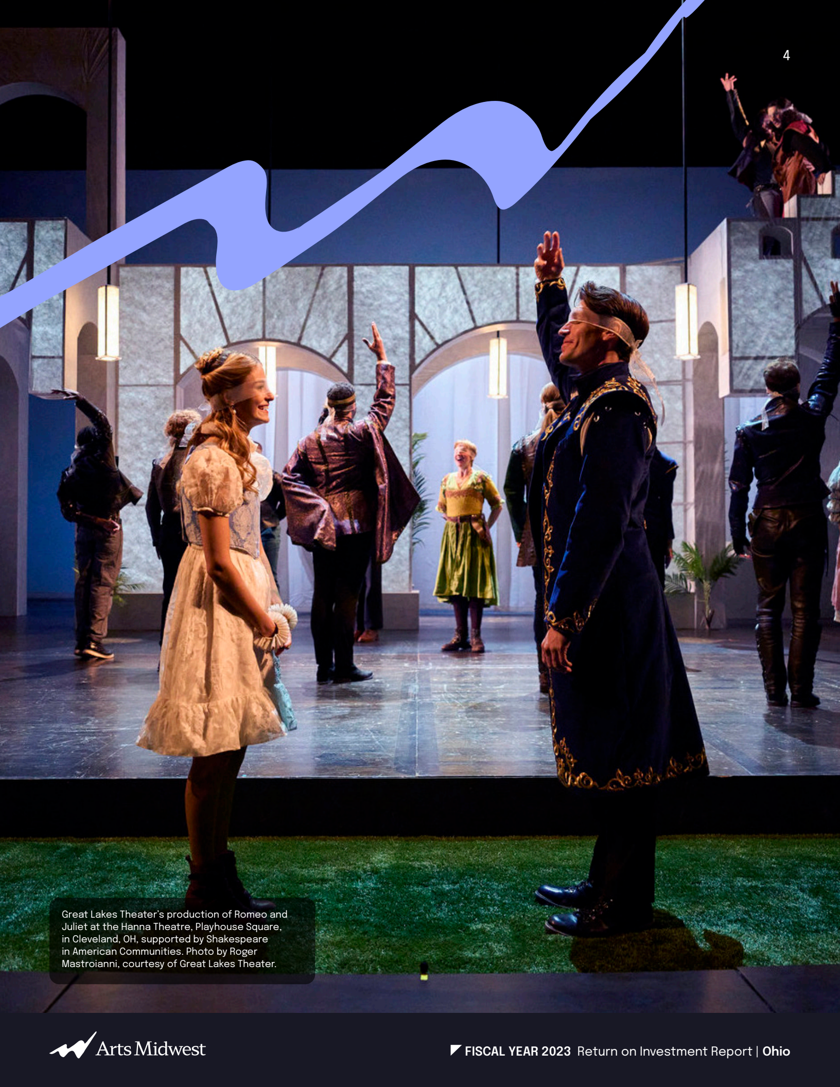
Great Lakes Theater's production of Romeo and Juliet at the Hanna Theatre, Playhouse Square, in Cleveland, OH, supported by Shakespeare in American Communities.