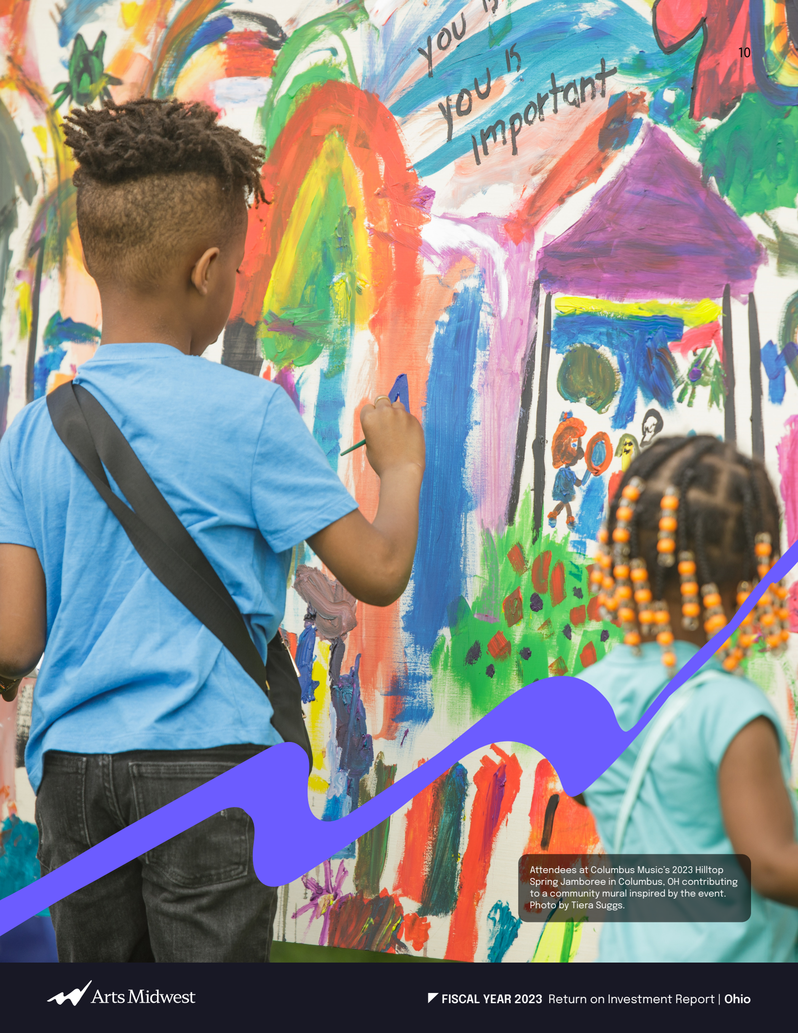
Attendees at Columbus Music's 2023 Hilltop Spring Jamboree in Columbus, OH contributing to a community mural inspired by the event.