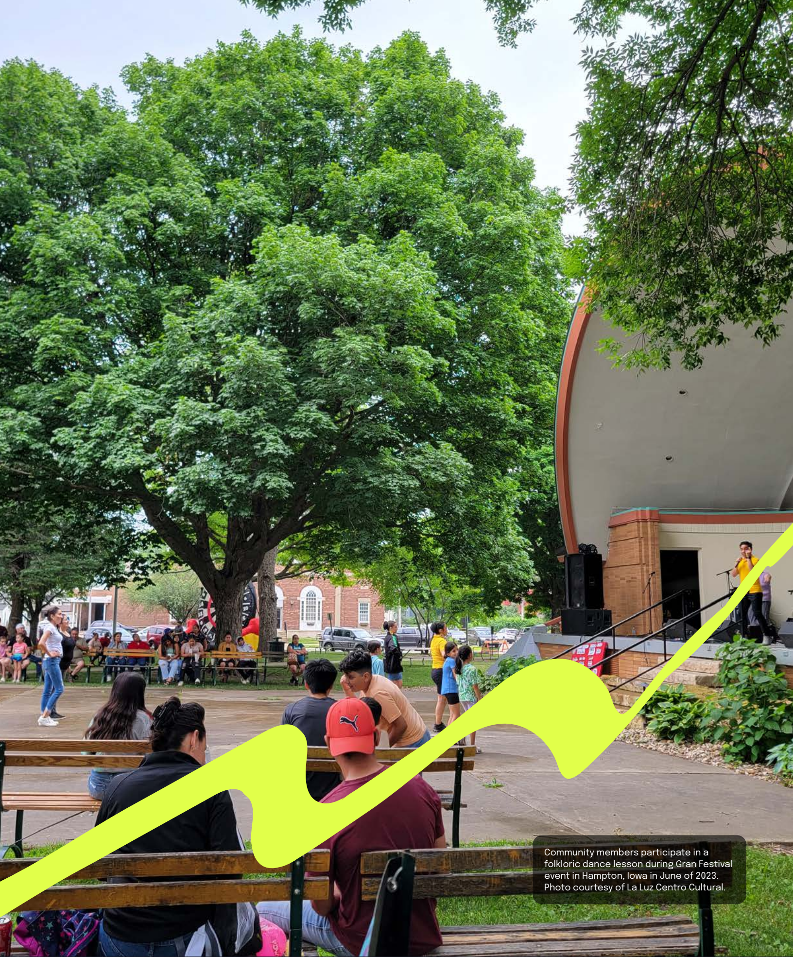
Community members participate in a folkloric dance lesson during Gran Festival event in Hampton, Iowa in June of 2023.