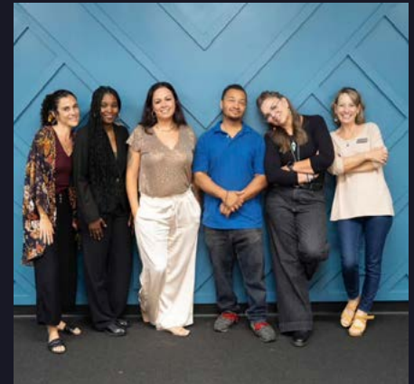
Program collaborators, supporters, and lead resident artists pose at the Artist in Residency Showcase in Northwest Indiana in September of 2023.