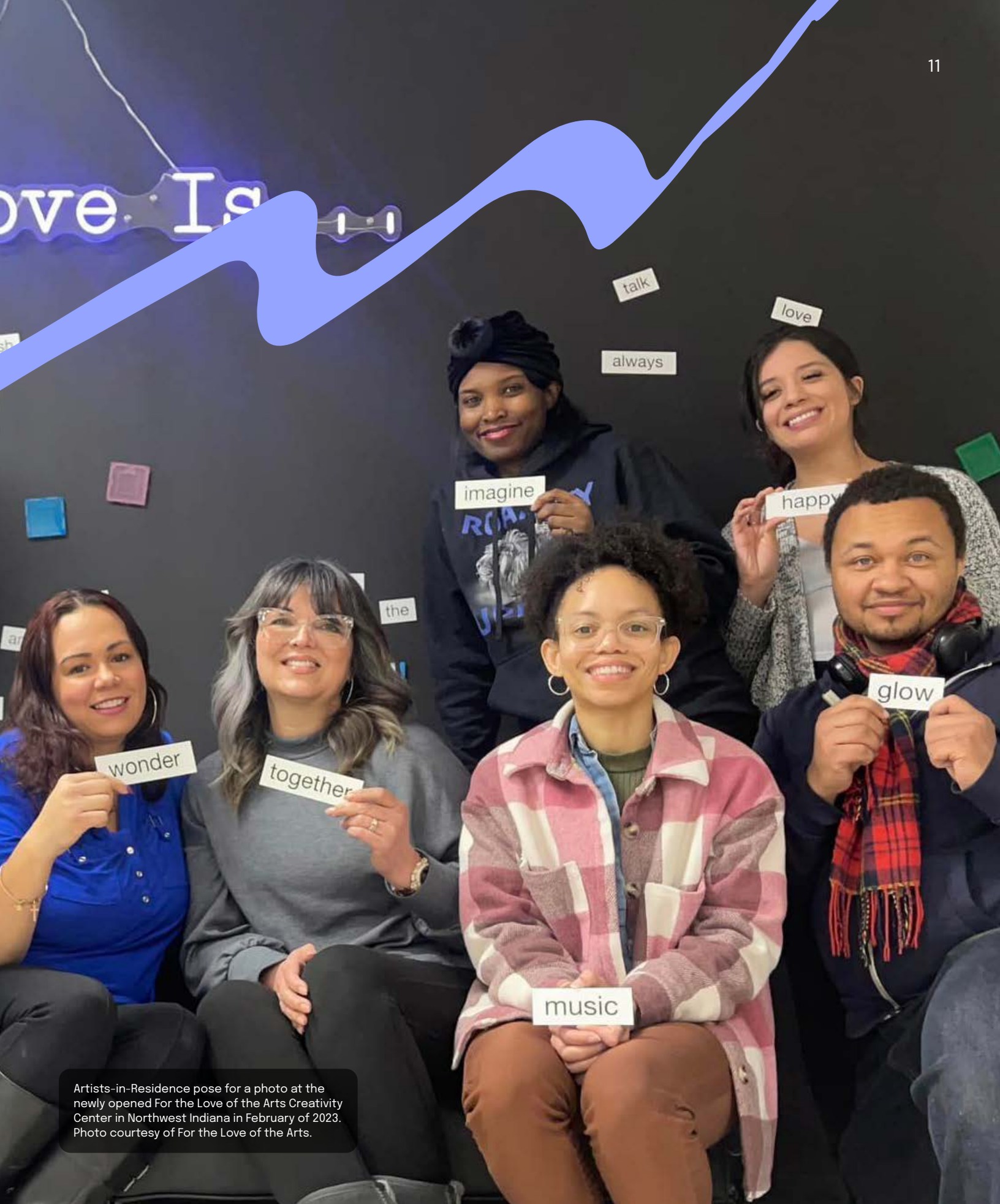
Artists-in-Residence pose for a photo at the newly opened For the Love of the Arts Creativity Center in Northwest Indiana in February of 2023.