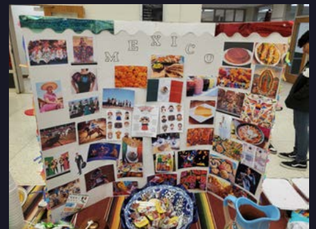
Students took part in a exchange event to share their cultures and backgrounds.