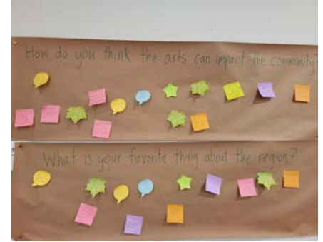
Community members and artists respond to prompts at the For the Love of the Arts We the Many Visioning Party in Northwest Indiana in December of 2022.

Arts Midwest worked collaboratively with state arts agency partners and lead partner organizations throughout the program’s life cycle. These collaborations ranged from equity-based partner selection and outreach with state arts agency partners, to community visits and project visioning with organizational partners, to monthly cohort gatherings with organizational partners and artists, to project implementation led by organizational partners, to storytelling and celebration with both organizational partners and state arts agency partners.