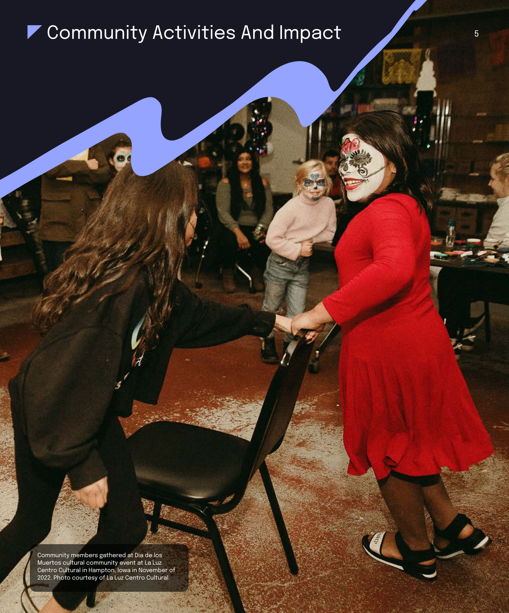
Community members gathered at Dia de los Muertos cultural community event at La Luz Centro Cultural in Hampton, Iowa in November of 2022.