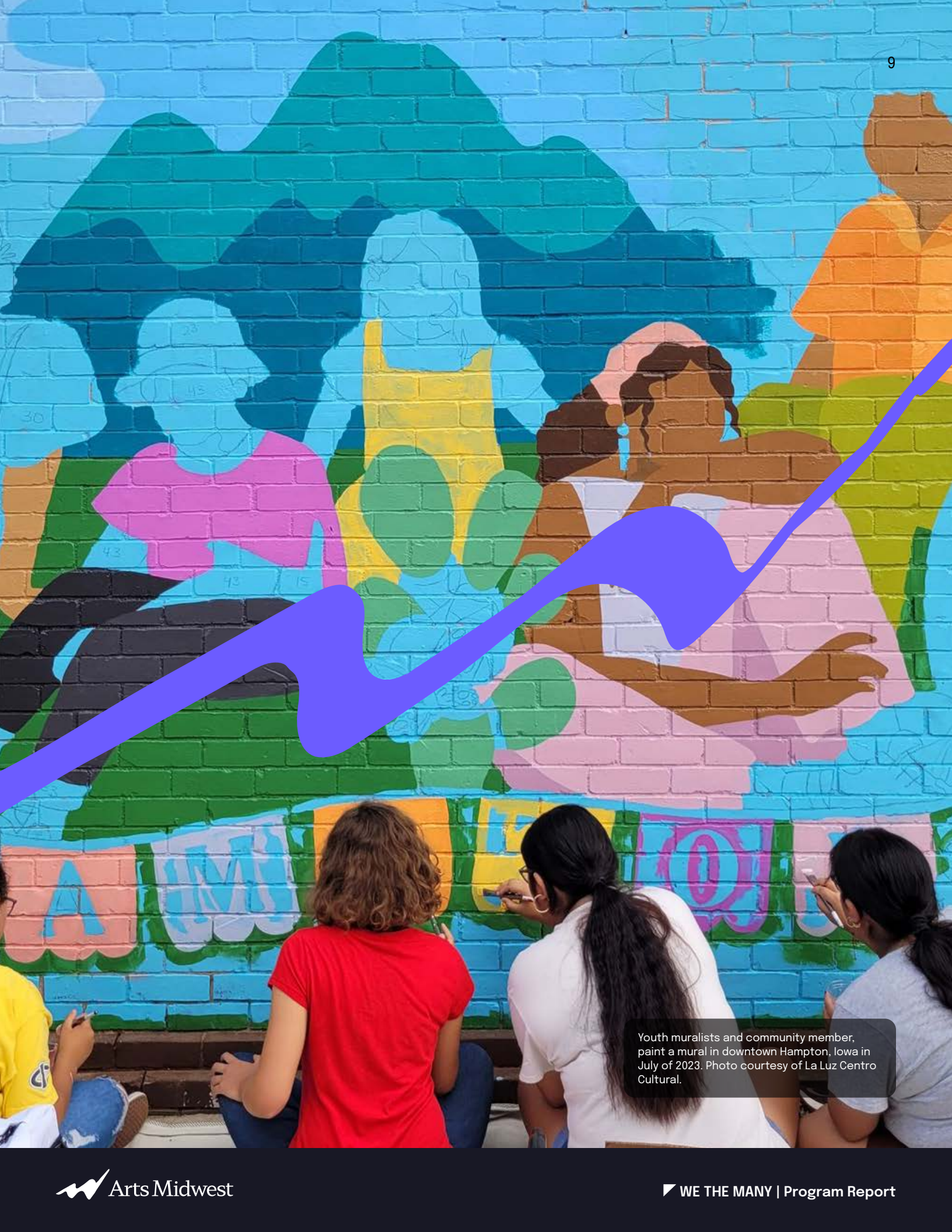
Youth muralists and community member, paint a mural in downtown Hampton, Iowa in July of 2023.